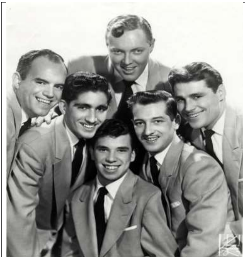
BILL AND HIS COMETS IN 1954