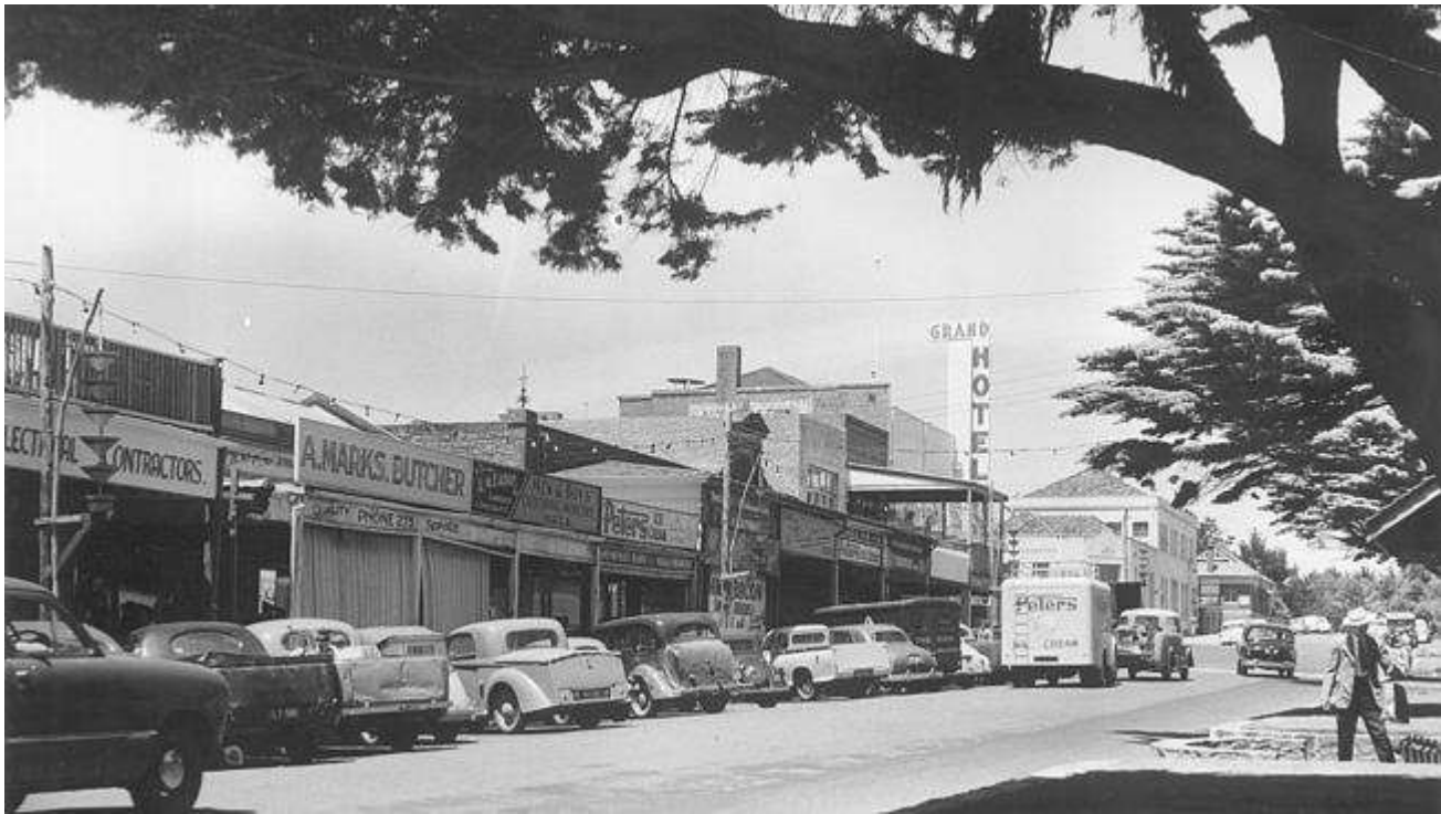
Bay Street Frankston in 1954